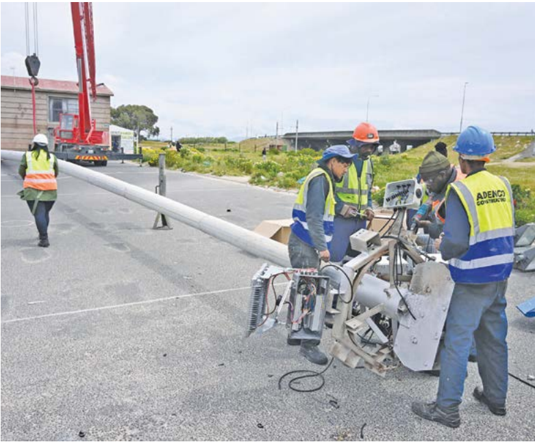
Bit more than changing a bulb: The LED retrofit of high-mast streetlights in Khayelitsha is in full swing. A tad more complicated than your average bulb change, the work involves a crane truck and an expert team to get these massively tall structures down, and up again.

In September, more than 5 000 streetlight-related repairs were carried out across town. Vandalism and theft of electricity infrastructure continues to pose a significant challenge, undermining the City's service delivery efforts. Report suspicious behaviour anonymously to the Public Emergency Communication Centre at 021 480 7700.