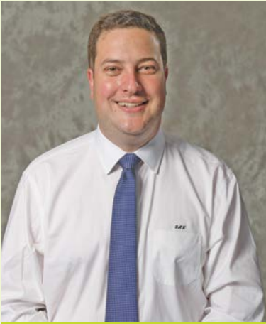
A MESSAGE FROM THE EXECUTIVE MAYOR

Also important is the safety of visitors and locals alike, which is why we have once again made a record