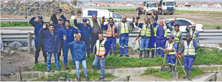
Far from sweet: Illegal dumping in the section of the Soet river flowing through Lwandle and Nomzamo, Strand, remains a challenge, despite the City already spending at least R1,5 million a year on efforts to clean this waterway.

Flowing from the northeast in a south-westerly direction, the Soet river forms the central 'spine' of its 17,4 km 2 catchment's drainage network. The catchment has a variety of land uses. The upper sub-catchments to the north of Sir Lowry's Pass Road are generally agricultural, while below the Sir Lowry's Pass Road, land use is predominantly medium to high-density residential, with pockets of industrial and commercial development.