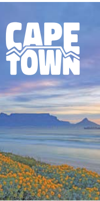
The very picture of Cape Town: The City has unveiled a striking new international logo to represent Cape Town on the global stage. Officially unveiled in September, the logo is set to play a key role in promoting the Mother City as a bucket-list destination for living, working and leisure. The logo's bold design is a blend of stylised typography and the iconic silhouette of Table Mountain. This unique combination creates a memorable visual identity that reflects Cape Town's energy and distinct character. The clean lines of the mountain profile are unmistakably Cape Town, while the impactful typeface emphasises the City's forward-thinking and innovative spirit.