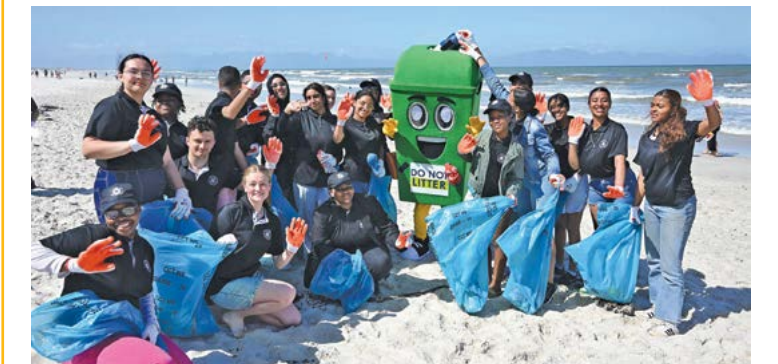
Bag it, bin it, win it: The Junior City Council (JCC) and the City's anti-litter mascot Bingo took part in a beach clean-up as part of the City's #SpringCleanCT campaign. The City supports these community clean-ups with the provision of refuse bags and removal of the collected waste.

* Note that the provision of bags and assistance with waste removal should not be misconstrued as a promise of employment. Community clean-ups remain entirely voluntary.