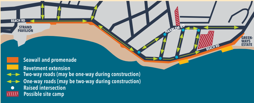
Path of least resistance: Traffic should continue to flow without any major disruption. The contractor's traffic management plan does include a stop/go system in Beach Road, depending on where work is being carried out.

where works are under way. All affected residents and businesses will have continuous access to their properties, and pedestrians will have a temporary corridor walkway to use.